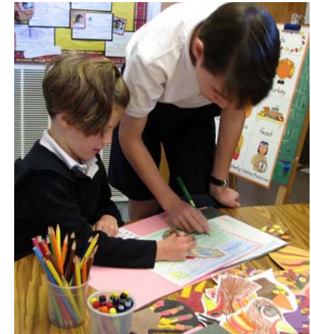
A fifth grader assists his kindergarten buddy with an art project.

Additionally, students learn virtues such as empathy, conscience, self control, respect, tolerance, kindness and fairness. Students not only learn the concept of virtues, but how to apply them in everyday life as evidenced by the cooperative environment on the playgrounds and in the classrooms.