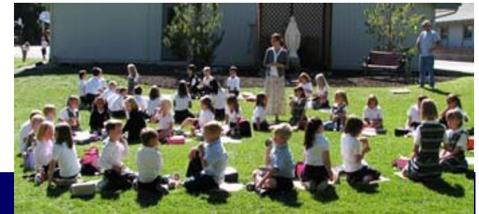
Spring brings outdoor learning opportunities at the school.