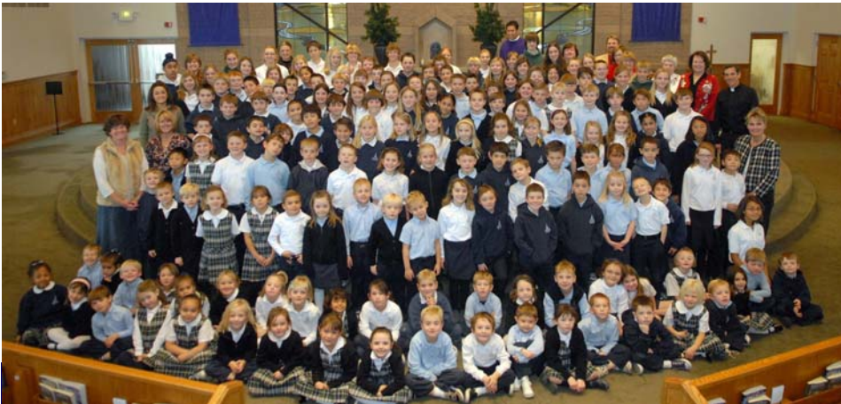
Students and teachers enjoy the annual all-school photo at St. Teresa Church.