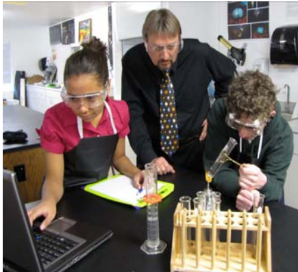
Middle school students conduct an experiment in the science lab.

To ensure a top level education and positive experience for our students, St. Teresa uses the latest teaching methods: