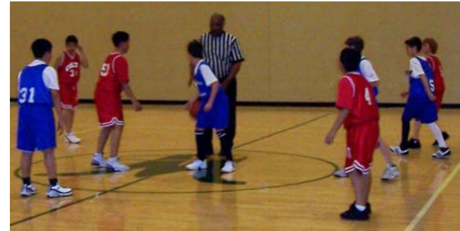
St. Teresa fifth grade boy's basketball plays Little Flower School at the Bishop Manogue gym.

At St. Teresa School we understand that a well-rounded education extends far beyond the walls of a classroom. We encourage students to explore a variety of extra curricular activities to further enhance their time here. Therefore, St.