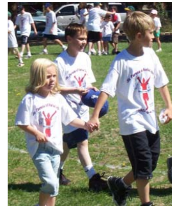
The annual Walk Jog-a-Thon.

At St. Teresa School we understand that a well-rounded education extends far beyond the walls of a classroom. We encourage students to explore a variety of extra curricular activities to further enhance their time here. Therefore, St.