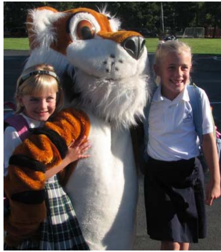
The St. Teresa Tiger mascot greets children on the school playground.

Founded in 1957, St. Teresa of Avila Catholic School has established a reputation for giving parents exactly what they desire when it comes to their children's education. St. Teresa provides exceptional education in a faith-based environment and a support system that encourages involvement, learning and confidence. We offer all-day Kindergarten through 8th grade, and we are introducing a preschool for 3 and 4 year olds in the 2009 - 2010 school year.