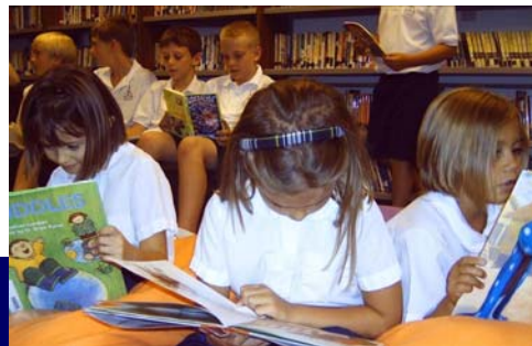
Students in all grades enjoy time in the new library.