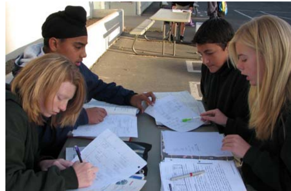
Middle school students work on a group project.

St. Teresa School's educational philosophy is to provide an enriching academic curriculum combined with a faith-based environment. Understanding that all students learn in different ways, St. Teresa's teachers utilize a combination of hands-on, visual and cooperative activities along