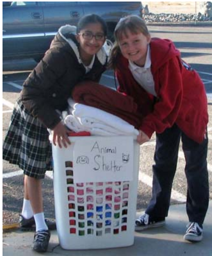
Fourth grade students hosted a holiday drive benefitting the Carson City Animal Shelter.

In addition, as part of St. Teresa's goal to foster community, parent participation is both encouraged and welcomed. Parent volunteers assist daily with classroom management as well as other activities such as field trips, fairs and as guest speakers.