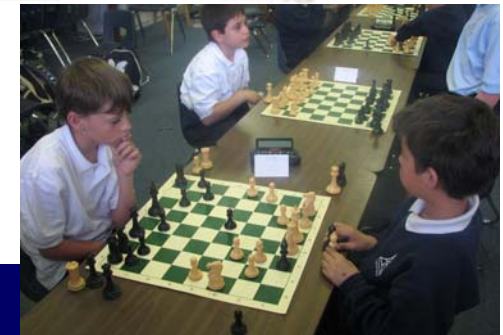
Chess Club members test their skills.